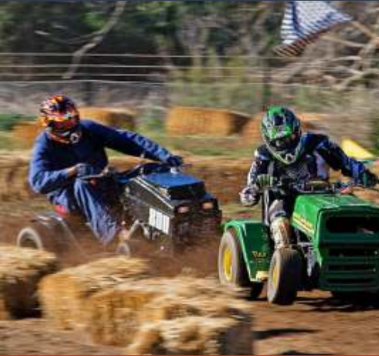
LAWN MOWER RACING