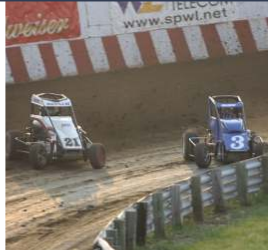
MIDGET CAR RACING