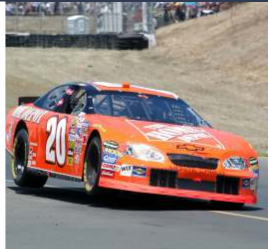
STOCK CAR RACING