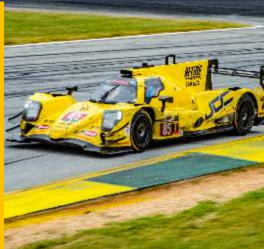
SPORTS CAR RACING