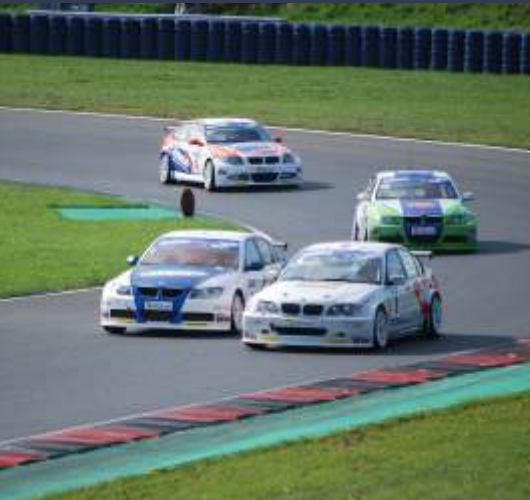
TOURING CAR RACING