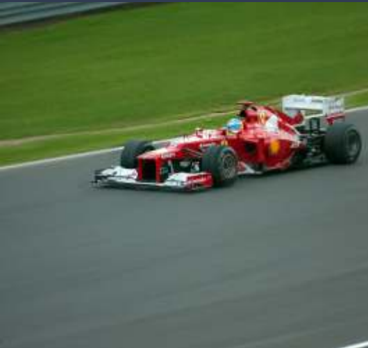
OPEN WHEEL RACING